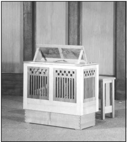
Schreiner Pipe Organs Opus 5 Available for sale