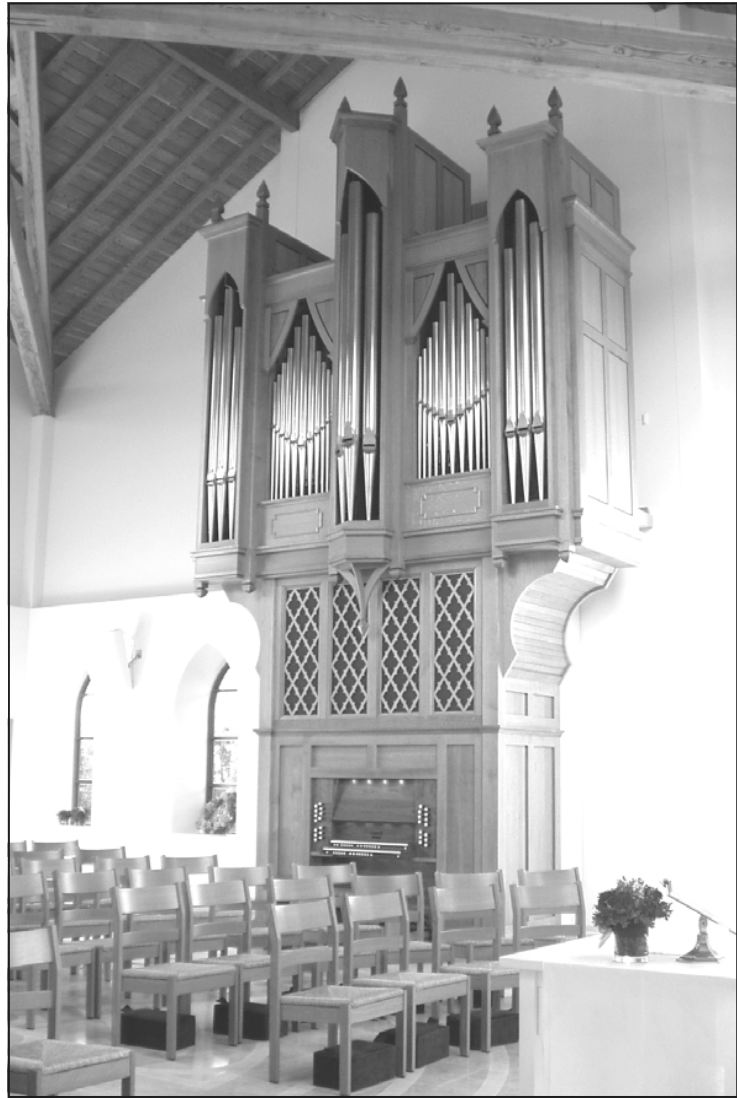
Schreiner Pipe Organs Opus 6 ~ C. B. Fisk Opus 131 St. Paul's Episcopal Church, Winston-Salem, NC