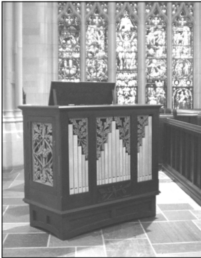
Schreiner Pipe Organs Opus 7 Kirk in the Hills, Bloomfield Hills, MI

Historically informed designs for today's musicians